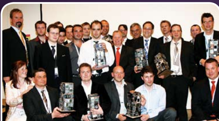
WIMA 2007: Winners, finalists & Jury members from the 1 st European NFC Competition "TOUCHING THE FUTURE"

For more information and to enter please contact: competition@nfc-forum.org www.nfc-forum.org/competition